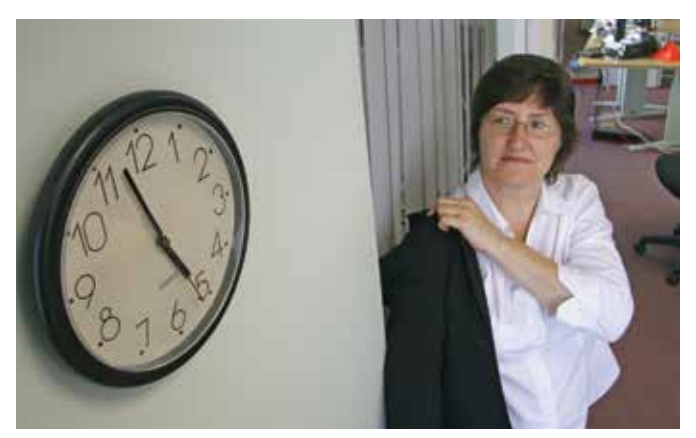
At the stroke of five...

civil service, geared to advancing the common good, which has made the world's second largest economy what it is todav.<sup>23</sup>